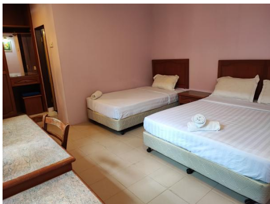
TRIPLE BEDROOM ( 1 QUEEN+ 1 SINGLE BED)