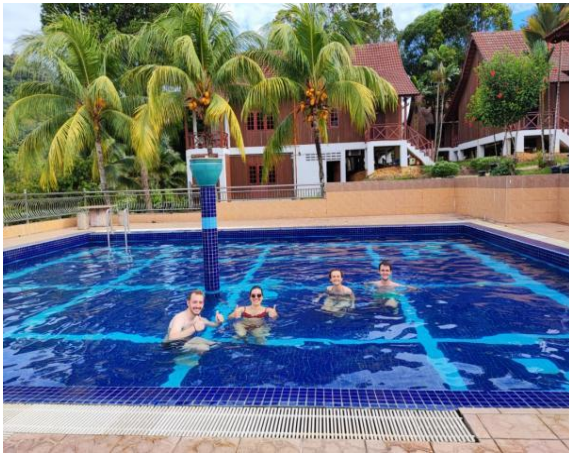
THE ONLY RESORT WITH SWIMMING POOL