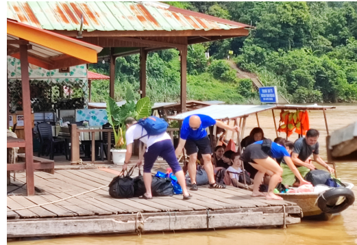
SG TEMBELING'S JETTY