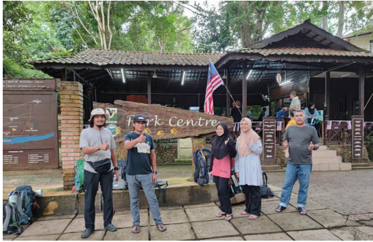
THE REGISTRATION CENTER