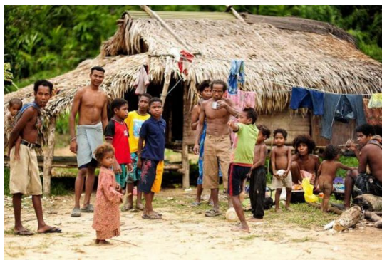
KAMPUNG ORANG ASLI