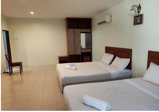
QUAD ROOM ( 2 QUEEN BEDS)