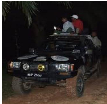
NIGHT SAFARI BY 4-WHEEL DRIVES