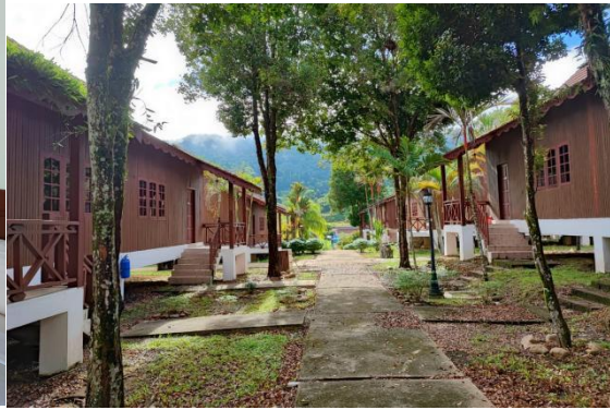
CHALETS RESORT WITH BALCONY