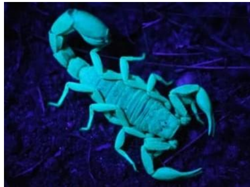
NIGHT JUNGLE WALK