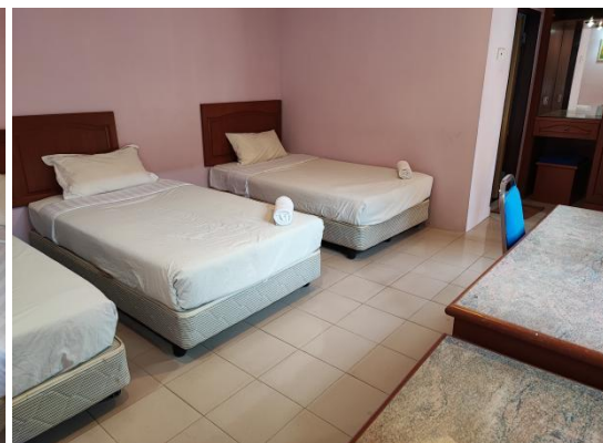
TRIPLE BEDROOM ( 3 SINGLE BEDS)