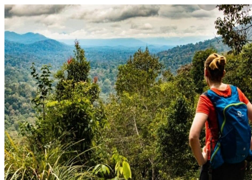
JUNGLE TREKKING IN THE OLDEST RAINFOREST (130 MILLION YEARS) IN THE WORLD